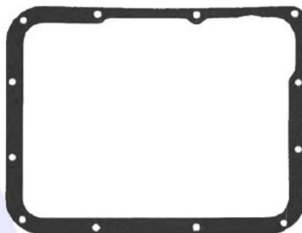
HYDRAMATIC STANDARD DUAL